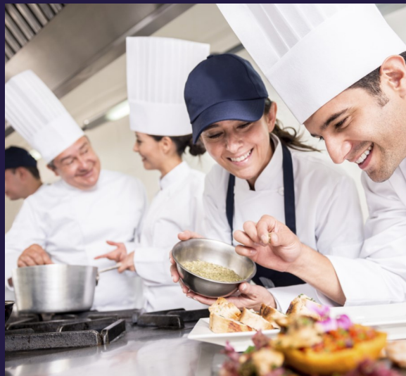
Truckee Meadows Community College