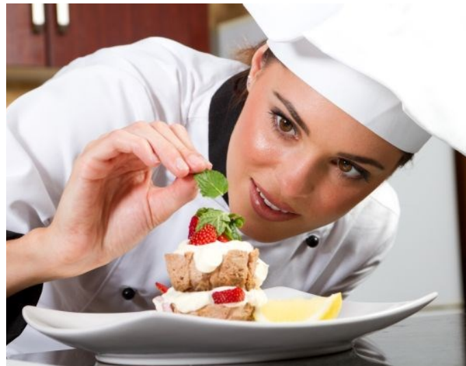
Truckee Meadows Community College