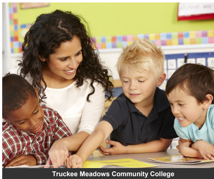
Truckee Meadows Community College